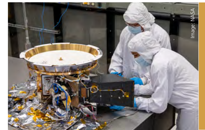
In the laboratory at NASA's Goddard Space Center in Greenbelt, Maryland, two researchers work on L'Oréal, the most complicated instrument on the Lucy mission. It comprises a camera that will take colour images and an infrared spectrometer.

More discoveries soon followed. Today, we know of more than one million small bodies in the Main Asteroid Belt. These are thought to be the remnants of the planet-forming process: debris made of rock,