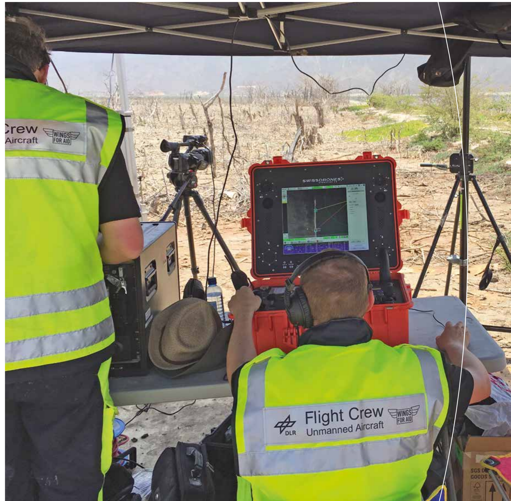
The ground station is like a camp, but has everything the crew needs to track the autonomous flying helicopter.

The turbine is started, the rotors turn at their nominal speed, and our superARTIS takes off. Its destination lies far out of sight – all the way across the lake. There, it will drop the boxes containing the relief goods. The helicopter is on its way now. Flying at an altitude of 100 metres, it speeds away, and soon all that remains is a small point on the horizon. As always, a strange feeling besets us when the helicopter finally disappears from view. And we suddenly become aware of just how remarkable this test in the Dominican Republic still is.