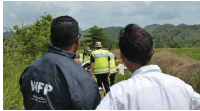
The aircraft and technology are carefully transported to different test areas of the Dominican Republic