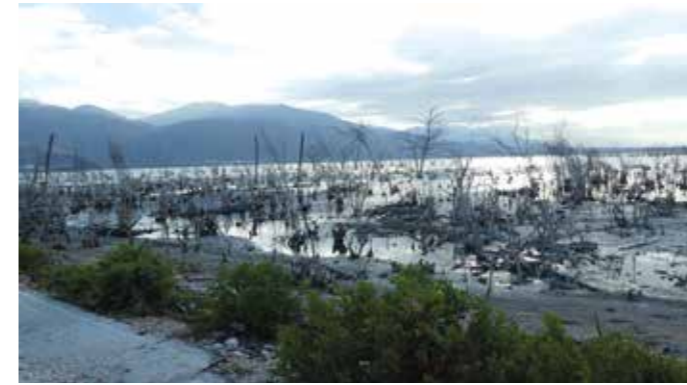
The hypersaline Lake Enriquillo grows quickly in the rain – a good test area for rapid humanitarian aid.