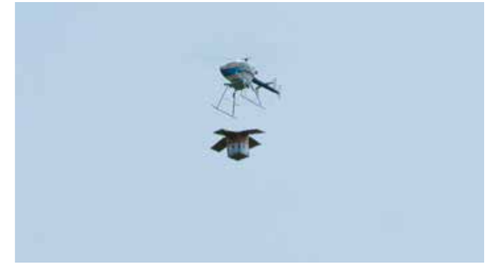
The boxes adapted for aid operations with drones unfold automatically when dropped