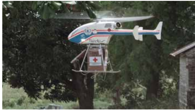
superARTIS' mission is to quickly, cost-effectively and safely transport vital goods to locations in need of assistance.