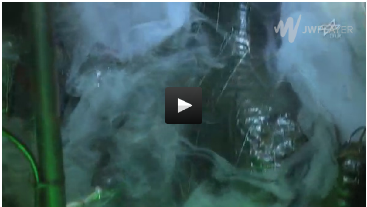
Video: Cabin research

More and more electronic systems such as individual entertainment screens are being used in the cabins of modern aircraft; the additional heat that these devices dissipate needs to be removed from the cabin. Conventional ventilation systems are beginning to reach the limits of their capabilities; they are required to supply ever-greater amounts of cooled air, which can cause passengers to experience unpleasant draughts. Researchers from DLR Göttingen and Airbus have flight-tested a ventilation system that promises to provide a solution to this problem using DLR's Advanced Technology Research Aircraft (ATRA). The new system is known as 'displacement' ventilation. In contrast to existing systems, displacement ventilation delivers air into the cabin at a lower speed and through inlets at floor level. As it makes contact with passengers and other heat sources, the air heats up and slowly rises, arriving where it is needed without causing draughts.