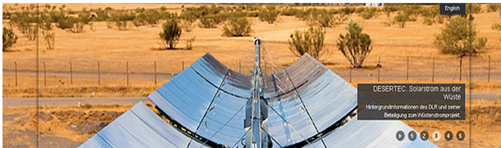
... and the so-called "Panorama header".

The Panorama feature positioned above the terminal has several functions. It attracts the attention of users to current and key topics and then uses links to guide them to the appropriate page; it also replaces the header. All this is complemented with traditional article teasers, the latest blog posts, RSS feeds, updates from DLR social media channels, current vacancies and editors' picks.