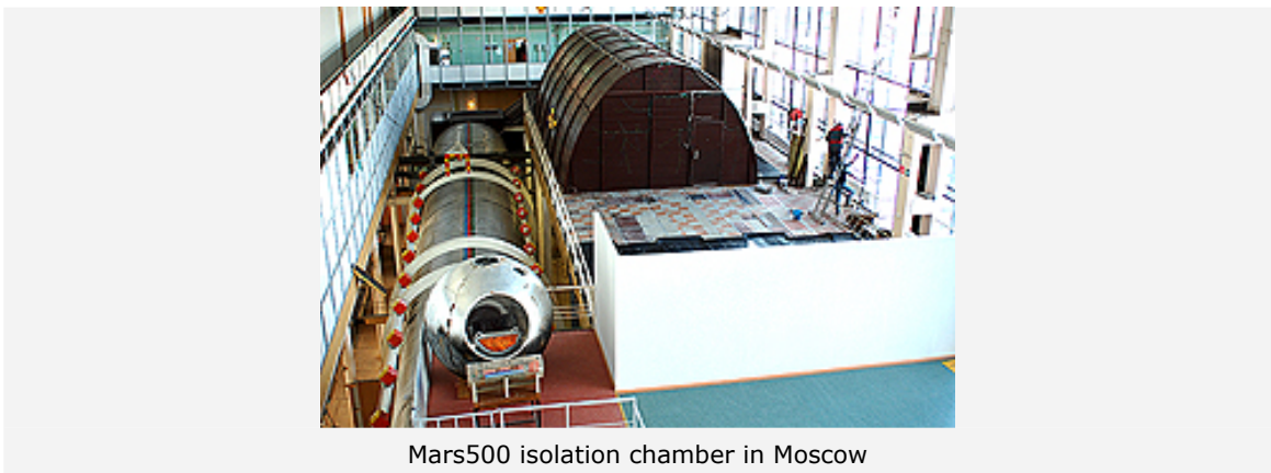
Mars500 isolation chamber in Moscow

Such a human spaceflight mission, which could become a reality in about twenty to thirty years, places extremely high demands on the crew. Apart from long microgravity and short hypergravity phases and the influence of cosmic radiation, which is not being investigated in the context of the Mars500 mission, the loss of visual contact with Earth must be compensated for and vital decisions will need to be taken autonomously due to delayed radio communication with the ground. In addition to this, astronauts should also be able to service the technical systems of their spacecraft without deliveries of additional equipment.