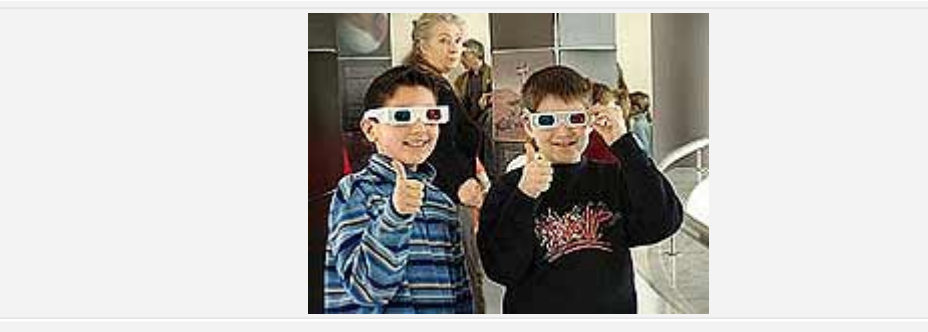
Inspired visitors to the Mars exhibition.

From 6 June until 5 July 2006, the German Aerospace Center (DLR) will exhibit 'A New Perspective on Mars' at the UNO City lobby in Vienna. Free of charge, the exhibition will include fascinating largeformat 3D images in a definition never seen before, taken by the German-operated High Resolution Stereo Camera (HRSC) installed onboard the European Mars Express space probe. In addition, a wide variety of information about the planet Mars, its moons and the exploration of the Red Planet will be presented.