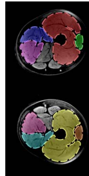
Muscle cross section (thigh)