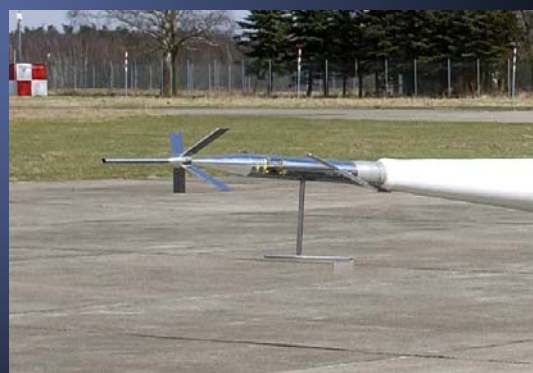
Nose Boom with Pitot Static Probe and Vanes ( \alpha , \beta )