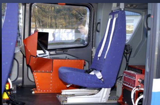
Workstation for the Flight Test Engineer