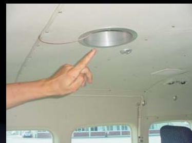
2 openings on top of fuselage