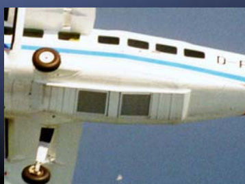
2 covered large openings in the bottom of fuselage