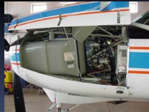
High power generator ( 300A @ 28V )