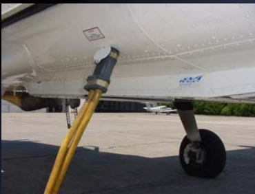
External experimental power supply

Due to various modifications on the aircraft structure and aircraft system the DLR C208B is a unique multipurpose research aircraft