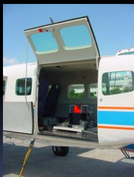
large cargo door