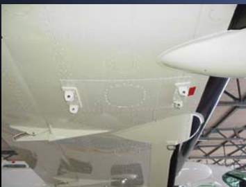
2 under wing hard points