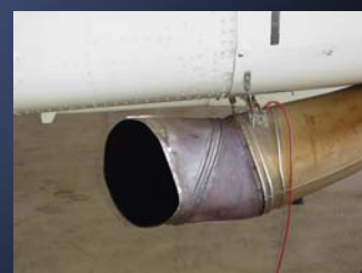
Special exhaust system to prevent measurement interference