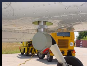
Additional small floor opening