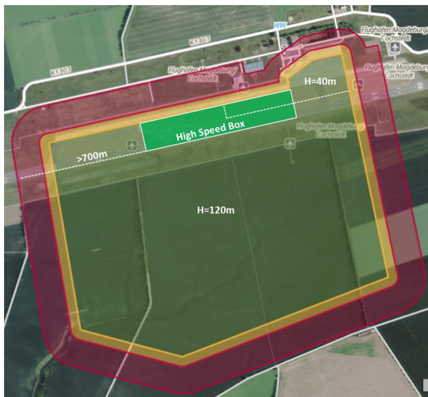
Figure 1: Area of the GeoZone

Although the Geographical Zone was set up for the “Offshore Drone Challenge”, it is open to all drone operators who comply with the present operating agreement.