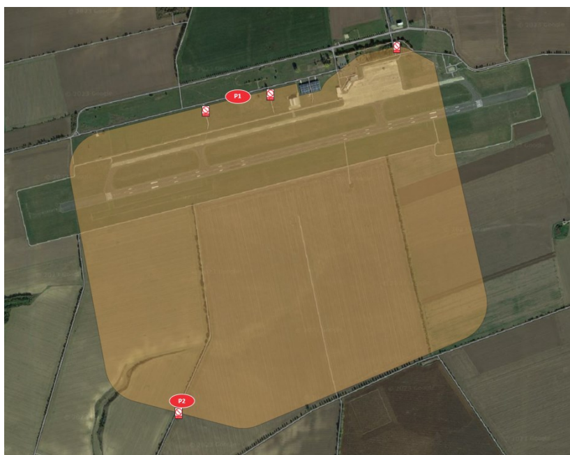
Figure 2: Risk area (Operational volume and risk buffer) and blocking of access ways

The risk area (operational area plus ground buffers) must be within (or equal to) the area shown in figure 1. There are some areas in the northern part of the airport that are outside the airport area and thus accessible by uninvolved persons. Additionally, the southern area of the volume is outside the airport area. It is mainly located on fields that enables the blocking described in the next chapter.