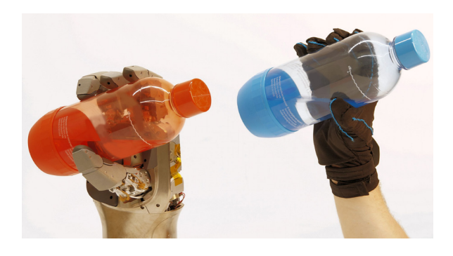
Dexterous and accurate telemanipulation of the Spacehand

In particular the experience gathered with SpaceJustin and Dexhand served as a baseline for the Kinfinity Glove design.