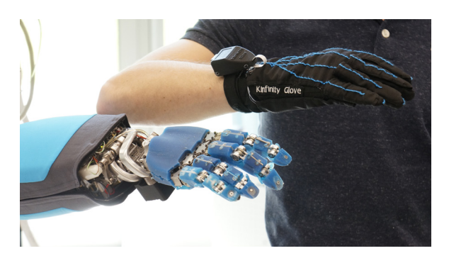
Accurate telemanipulation with the Kinfinity Glove on highly integrated Hand-Arm-System

Robotic Application: The Kinfinity Glove is the perfect input device for robotic hand telemanipulation.