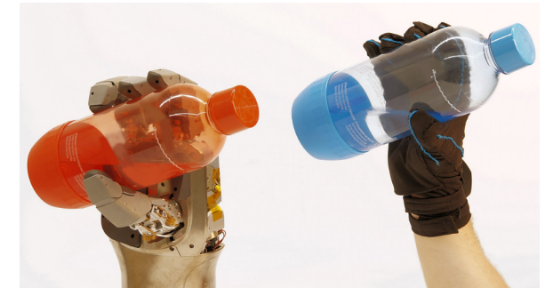
Dexterous and accurate telemanipulation of the Spacehand

In particular the experience gathered with SpaceJustin and Dexhand served as a baseline for the Kinfinity Glove design.