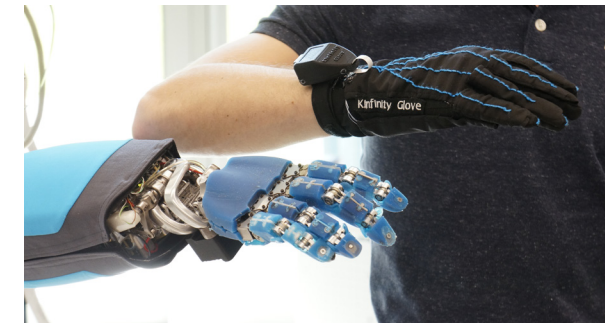
Accurate telemanipulation with the Kinfinity Glove on highly integrated Hand-Arm-System

Robotic Application: The Kinfinity Glove is the perfect input device for robotic hand telemanipulation.