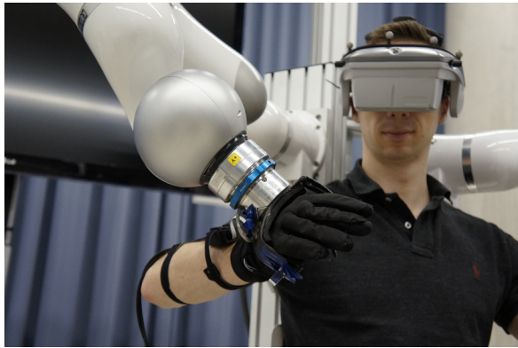
Dexterous manipulation task in a full VR environment.

Going further: New features for the Kinfinity Glove are continuously being added and tested at the Institute of Robotics and Mechatronics of the German Aerospace Center (DLR-RM).